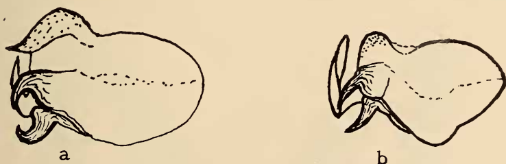
Fig. 5. Male clasps: a) Chlosyne lacinia ; b) C. riobalsensis .